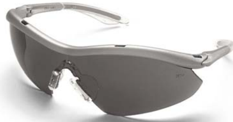
HB142 Shown Above