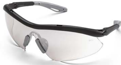
HB119 Shown Above