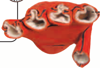
Cutaway view of full-sock lining