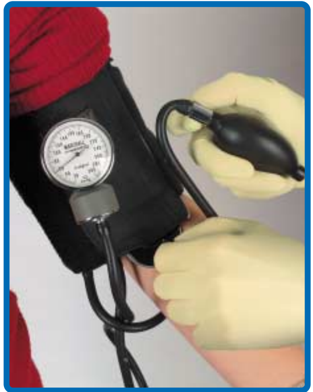
Sensatouch™ XTRA POWDER FREE LATEX

Powder Free Latex Textured Grip Class 1 Medical Device 5 mil Thickness 100 Gloves Per Dispenser 10 Dispensers Per Case Sizes: L, M, S, XL