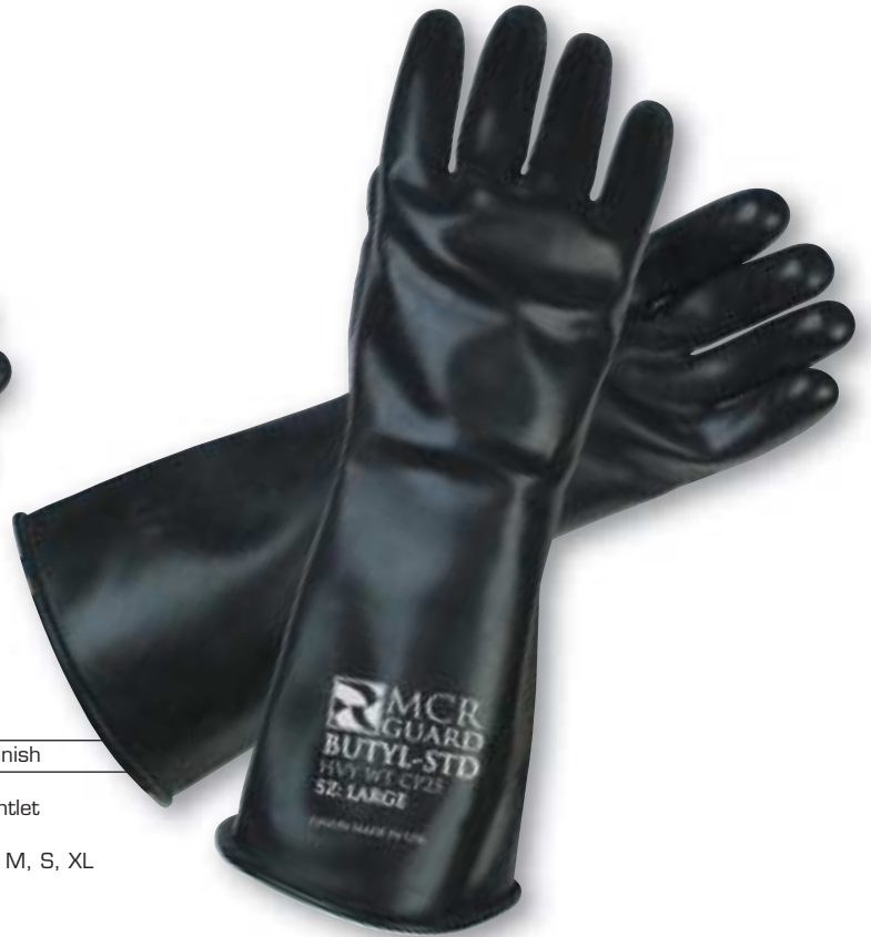
CP25 14" Gauntlet 25 mil Sizes: L, M, S, XL