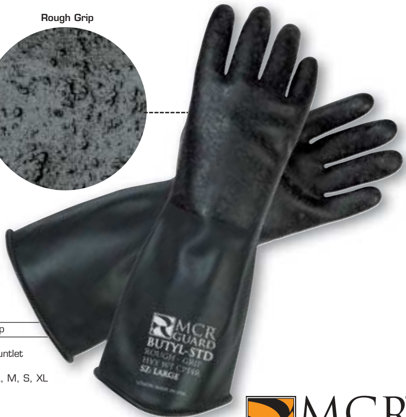
MCR Guard™ 5 Dip Rough Grip