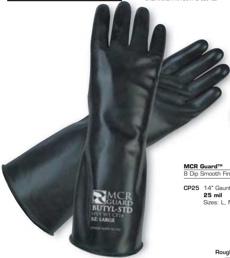
MCR Guard™ 8 Dip Smooth Finish