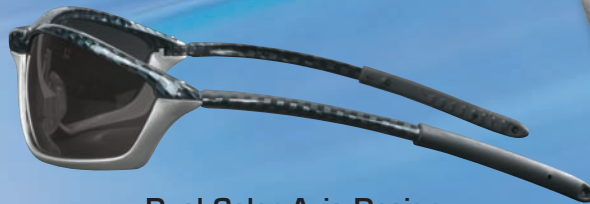
Dual Color Axis Design

Exceeding Expectations... Protecting Your Quality of Life.